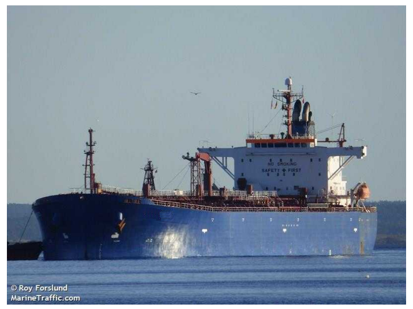
Nominated Vessel Photo:SEA DYNA

CUSTOMER : ALFORD MARITIME CONTACT PERSON : CAPT. NICK CLAY